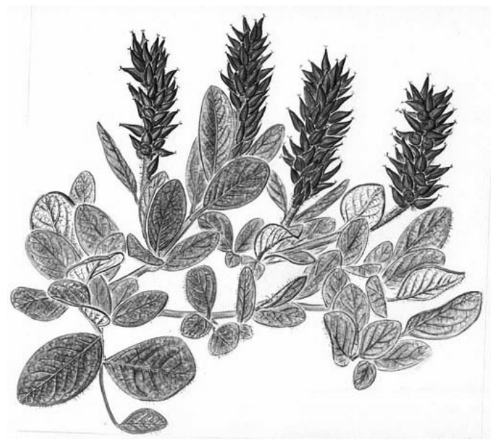
Salix ovalifolia illustrated by John Myers for volume 7.