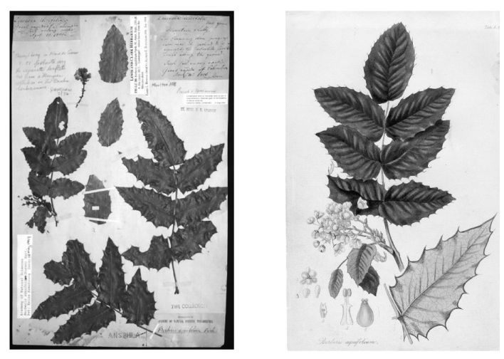
Type specimen of Berberis aquifolium Pursh, collected by Lewis and Clark (L), and, represented (R) and described by Frederick T. Pursh (1774–1820). The specimen is deposited at the PH Herbarium, and Pursh's publication ( Flora Americae Septentrionalis 1813) is deposited at the Ewell Sale Stewart Library at the Academy of Natural Sciences.

V ith support from NSF and the Mellon Founda- \mathbf V tion, PH is currently digitizing and imaging its holdings of more than 35,000 types. Because the Academy, founded in 1812, was one of the first scientific institutions in the New World, the herbarium holds more specimens collected prior to the early 1800s than any other institution in the Western Hemisphere. PH has the highest proportion of types to total number of specimens of any herbarium in the United States. It has more than 1.4 million botanical specimens collected by more than 600 botanists, including Baldwin, Barton, de la Billiardière, Canby, Clark, Elliott, Fogg, Jr., Forsters, Henry, Horsfield, Lambert, von Ledebour, Lewis (PH-LC), Long, Michaux, Mill, Muhlenberg, Nuttall, Parmentier, Pennell, Porter, Pursh, Rafinesque, Roxburgh, Royle, von Schlagintweit, Schweinitz, Short, Stone,